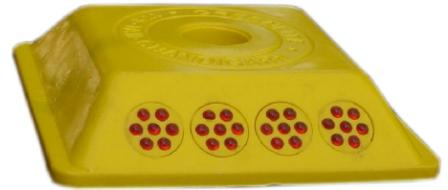
CAT PART NO. GPL-02-02

Uni(31 beads)/dual (62 beads)/tri-directional (93 beads) reflective cat eye of impact resistant ABS plastic stud 100x100mm having ultra-violet resistant colour (white/red/yellow) with ABS plastic strip containing 31 mini retro reflective glass beads of colour white/red/yellow to a side provided with steel zinc plated nail of dia 12mm and of length 120mm for fixing to road by hammering. Cat-Part No. GPL-02-01 Make: GREENS/GREENLITE.