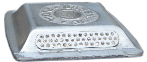
CAT PART NO. GPL-01-04

Uni(43 beads)/dual (86 beads)/tri-directional (129 beads) reflective cat eye of aluminium casted stud 100x100mm having ABS plastic strip containing 43 mini retro-reflective glass beads of colour white/red/yellow a side provided with steel zinc plated nail of dia 12mm of length 120mm for fixing to road by hammering. Cat-part No. GPL-01-03 Make: GREENS/GREENLITE.