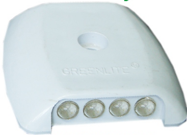
CAT PART NO. GPL-02-51

Uni (4 large beads)/dual (8 large beads) reflective cat eye of impact resistant ABS plastic stud 120X120mm having ultra violet resistant colour white having 4 large glass lens reflectors (Tiger-eye) of colour white a side provided with steel zinc plated nail of dia 12mm of length 120mm for fixing to road by hammering. Cat-Part No. GPL-02-51 Make: GREENS/GREENLITE.