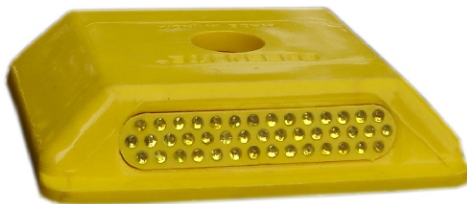
CAT PART NO. GPL-02-03

Uni(28 beads)/dual (56 beads)/tri-directional (84 beads) reflective cat eye of impact resistant ABS plastic stud 110x110mm double moulded solid state having ultra-violet resistant colour (white/red/yellow) with four round discs containing 28 mini retro reflective glass beads of colour white/red/yellow to a side provided with steel zinc plated nail of dia 12mm and of length 120mm for fixing to road by hammering. Cat-Part No. GPL-02-02 Make: GREENS/GREENLITE.