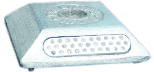
CAT PART NO. GPL-01-02

Uni(21 beads)/dual (42 beads)/tri-directional (63 beads) reflective cat eye of aluminium casted stud 100x100mm having 3 round ABS plastic discs containing 21 mini retro-reflective glass beads of colour white/red/yellow a side provided with steel zinc plated nail of dia 12mm of length 120mm for fixing to road by hammering. Cat-Part No. GPL-01-01 Make: GREENS/GREENLITE.