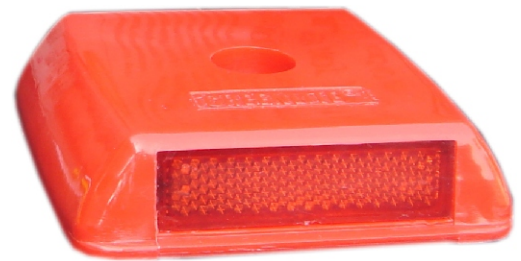
CAT PART NO. GPL-02-11

Uni (4 large beads)/dual (8 large beads) reflective cat eye of impact resistant ABS plastic stud 120X120mm having ultra violet resistant colour white having 4 large glass lens reflectors (Tiger-eye) of colour white a side provided with steel zinc plated nail of dia 12mm of length 120mm for fixing to road by hammering. Cat-Part No. GPL-02-51 Make: GREENS/GREENLITE.