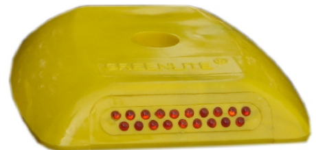
CAT PART NO. GPL-02-04

Uni(43 beads)/dual-directional (86 beads) reflective cat eye of impact resistant ABS plastic stud 100x115mm double moulded solid state having ultra-violet resistant colour (white/ red/yellow) with ABS plastic strip containing 43 mini retro reflective glass beads of colour white/red/yellow to a side provided with steel zinc plated nail of dia 12mm and of length 120mm for fixing to road by hammering. Cat-Part No. GPL-02-03 Make: GREENS/GREENLITE.