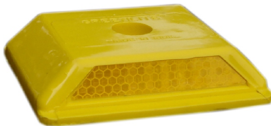
CAT PART NO. GPL-02-12

Uni/dual directional reflective cat eye of impact resistant ABS plastic stud 100X100mm having ultra-violet resistant colour (white/red/yellow) having micro cube corner spark glow reflector white/red/yellow to a side provided with steel zinc plated nail of dia 12mm and of length 120mm for fixing to road by hammering. Cat-Part No. GPL-02-11 Make: GREENS/GREENLITE.