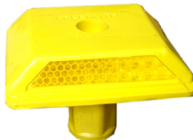
CAT PART NO. GPL-BS-02-12

Uni/dual directional reflective cat eye of impact resistant ABS plastic stud 100x100mm having ultra-violet resistant colour (white/red/yellow) having micro cube corner spark glow reflector white/red/yellow to a side provided with L-key steel 12mm dia bolt along with ABS plastic stem of length 55mm for fixing to road with epoxy adhesive. Cat-Part No. GPL-BS-02-11 Make: GREENS/GREENLITE.