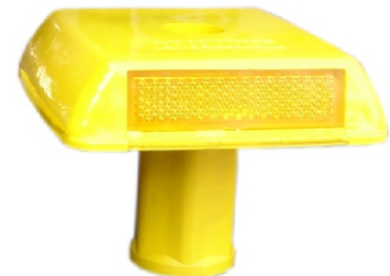
CAT PART NO. GPL-BS-02-11

Uni/dual directional reflective cat eye of impact resistant ABS plastic stud 100X115mm solid state double moulded having ultra-violet resistant colours (white/red/yellow) having micro cube corner spark glow reflector white/red/yellow to a side provided with steel zinc plated nail of dia 12mm and of length 120mm for fixing to road by hammering. Cat-Part No. GPL-02-12 Make: GREENS/GREENLITE.