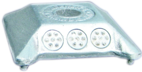
CAT PART NO. GPL-01-01

Uni(21 beads)/dual (42 beads)/tri-directional (63 beads) reflective cat eye of aluminium casted stud 100x100mm having 3 round ABS plastic discs containing 21 mini retro-reflective glass beads of colour white/red/yellow a side provided with steel zinc plated nail of dia 12mm of length 120mm for fixing to road by hammering. Cat-Part No. GPL-01-01 Make: GREENS/GREENLITE.