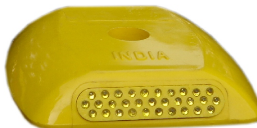
CAT PART NO. GPL-02-05

Uni(19 beads)/dual-directional (38 beads) reflective cat eye of impact resistant ABS plastic stud 120x120mm having ultra-violet resistant colour (white/red/yellow) with ABS plastic strip containing 19 mini retro reflective glass beads of colour white/red/yellow to a side provided with steel zinc plated nail of dia 12mm and of length 120mm for fixing to road by hammering. Cat-Part No. GPL-02-04 Make: GREENS/GREENLITE.