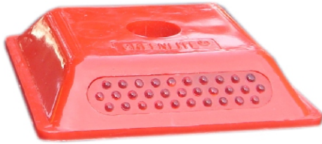
CAT PART NO. GPL-02-01

Uni(31 beads)/dual (62 beads)/tri-directional (93 beads) reflective cat eye of impact resistant ABS plastic stud 100x100mm having ultra-violet resistant colour (white/red/yellow) with ABS plastic strip containing 31 mini retro reflective glass beads of colour white/red/yellow to a side provided with steel zinc plated nail of dia 12mm and of length 120mm for fixing to road by hammering. Cat-Part No. GPL-02-01 Make: GREENS/GREENLITE.